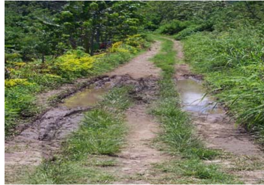
A typical village road in Manggarai during the dry season.

the recent disaster though, many villages were completely cut off, making the rescue effort all but impossible.